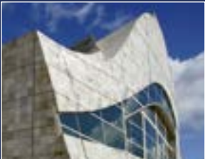
Partner Spotlight: GRUPO SANJOSE Page 6-7