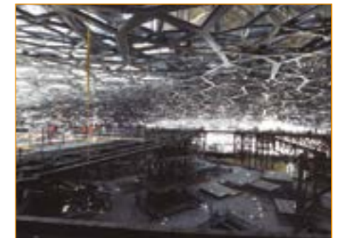
Louvre Abu Dhabi Museum