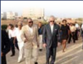
Olympic Swimming Pool Page 4