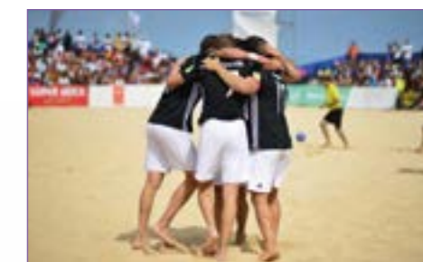
German players gearing up for a game