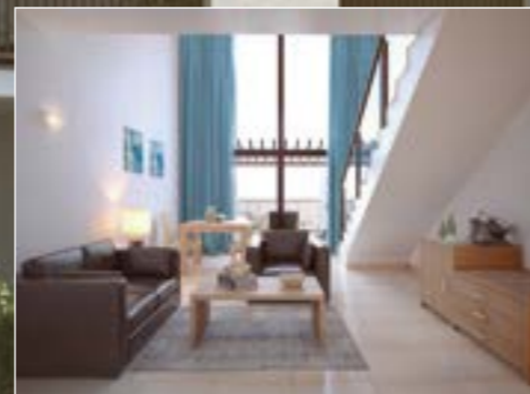
White Sands Hotel & Spa CGI's