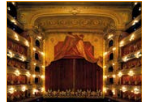
The Colon Theatre in Buenos Aires, Argentina