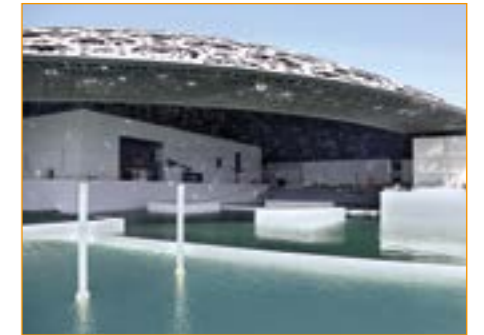
Louvre Abu Dhabi Museum

The architecture, as well as the amazing view and beach, of course. White Sands Hotel & Spa will be like an amphitheater looking out on to one of the best beaches in Cape Verde.