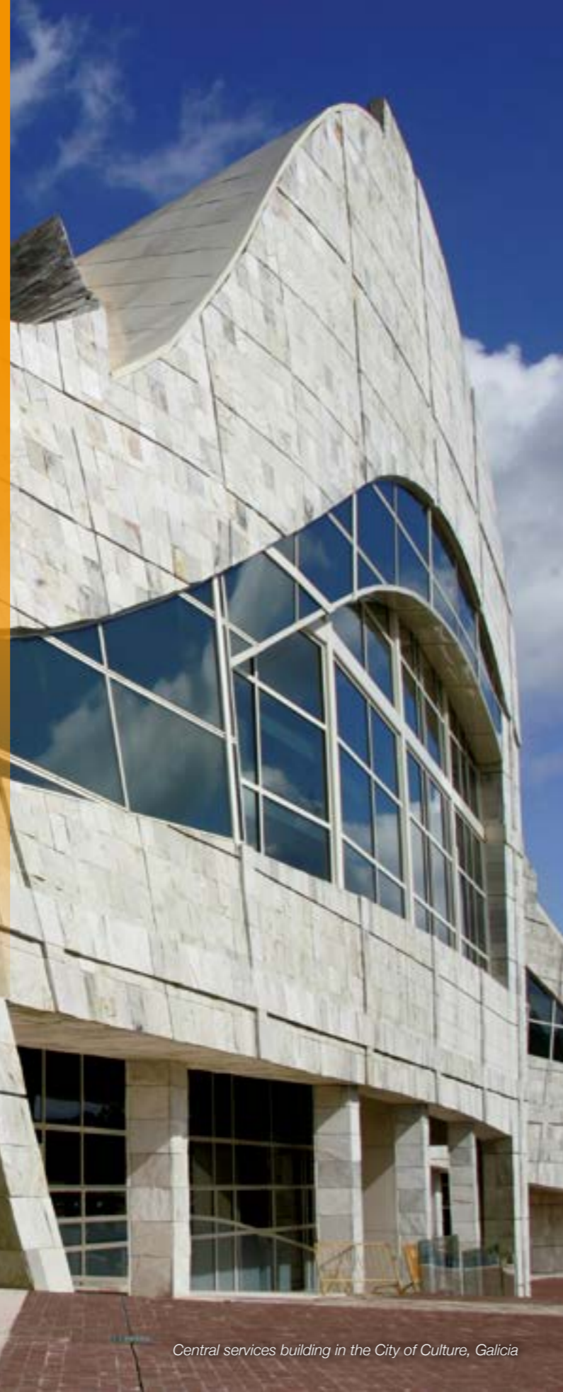
Central services building in the City of Culture, Galicia

As construction continues on White Sands Hotel & Spa, we turn the spotlight on our construction partners – GRUPO SANJOSE.