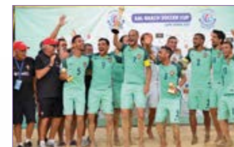
The Portuguese team win the tournament

Portugal was the favourite in the run-up, having won the trophy in the first event. It was a safe bet as the Portuguese team closed their Sal Beach Soccer Cup campaign with a convincing 12-3 win against host country Cape Verde on Sunday. Meanwhile, England pipped Germany to second place with a 3-1 win, after coming from behind with three impressive goals.