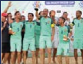
Sal Beach Soccer Page 11