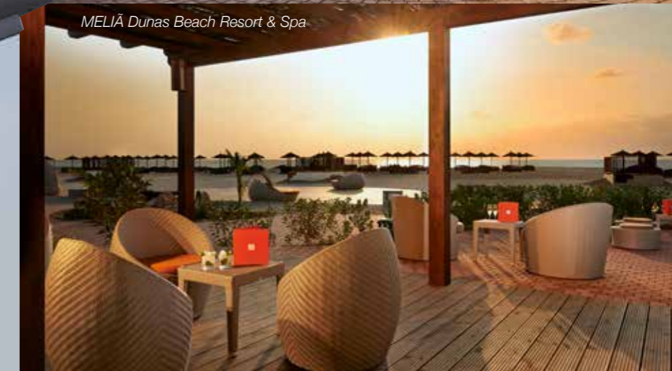
MELIÁ Dunas Beach Resort & Spa