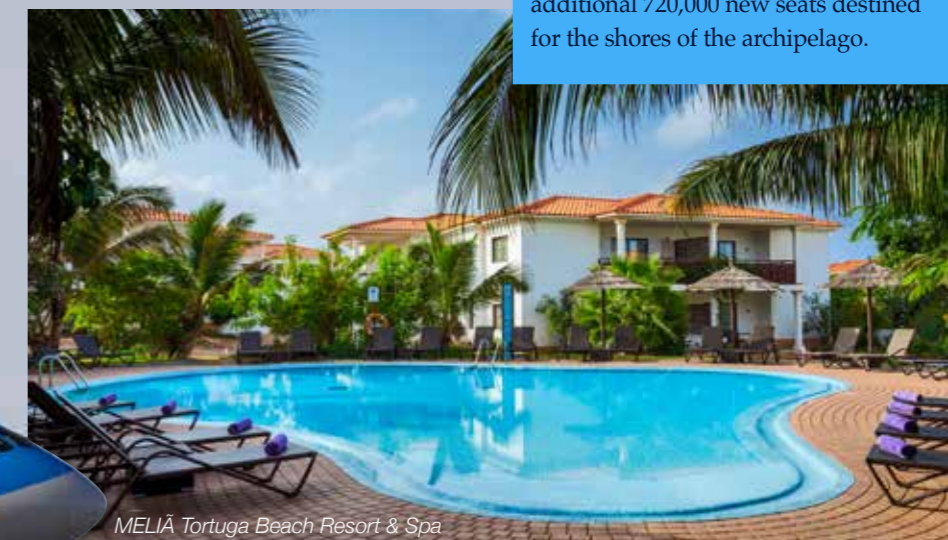
MELIÁ Tortuga Beach Resort & Spa